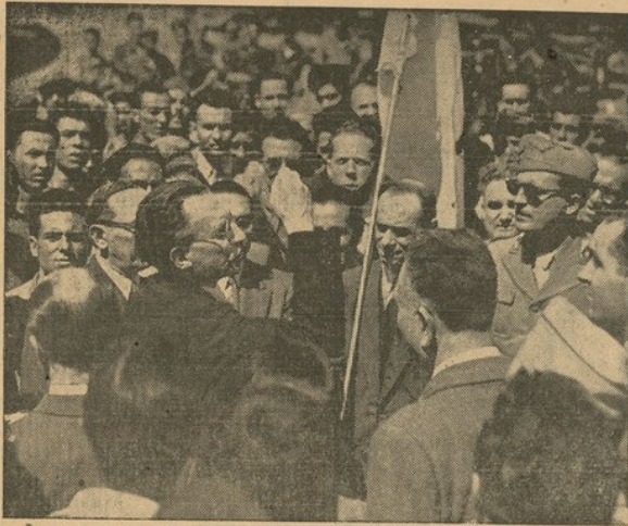
Mr. Alcide De Gasperi (In Center), Premier, is greeted by an enthusiastic crowd as his plane landed at Foggia Main Airport. Mr. De Gasperi on his way back to Rome after addressing a Christian Democrat rally in Bari was prevailed upon by the group at the airport to stop in Foggia and deliver a political address in Piazza XX Settembre.