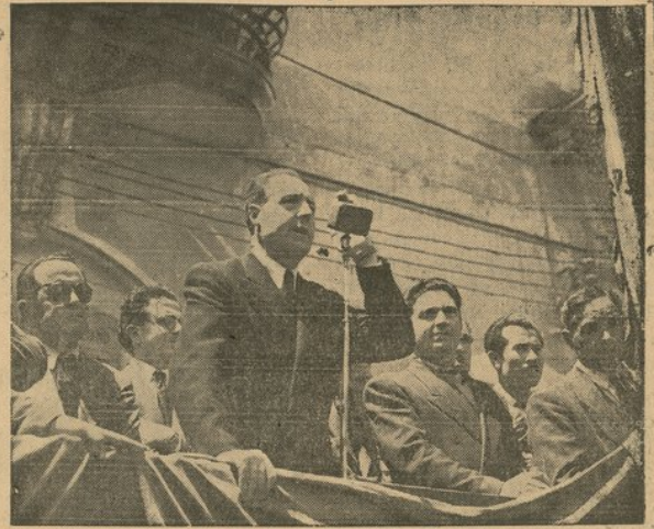
Mr. Giuseppe Saragat, former Italian ambassador to Paris, addresses a Socialist rally in Piazza XX Settembre. In his speech Mr Saragat discussed the question of the institutional form of government and declared that only a parliamentary and democrat republic can save Italy.