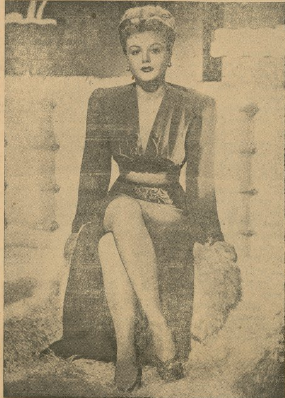
Angela Lansbury, says her press agent's fervent report, is demonstrating that a girl can look appealing without being unclad. She just sits there and asks you to read her mind. Pretty mean, we think. A woman can be thinking almost anything.