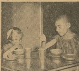
CHOW TIME A Teaspoon full