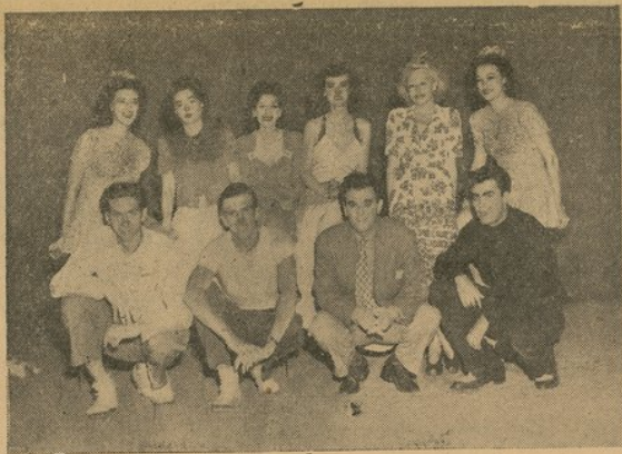
USO Variety Show concluded a six day billing last night.